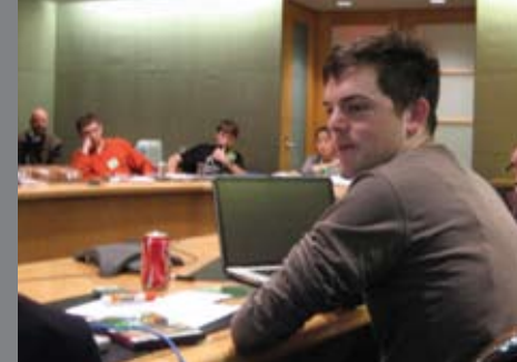
Nico Muhly guest lectures at a Making Score session.