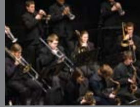
Jazz Band Classic