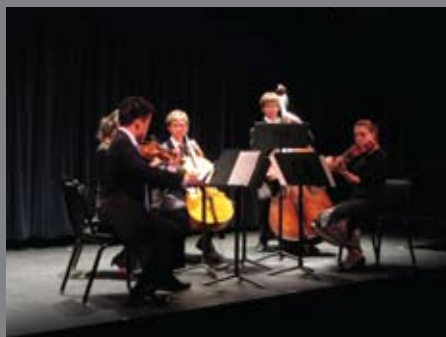
Chamber Music Program musicians perform at Symphony Space.