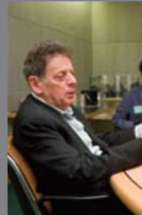
Philip Glass guest lectures at a Making Score session.