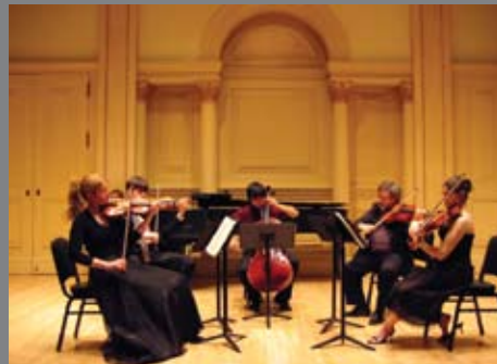
A Chamber Music Program ensemble performs at Carnegie Hall.