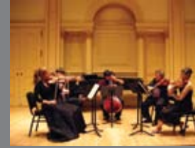
Chamber Music Program