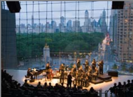
Jazz Band Classic swings in Jazz at Lincoln Center's Allen Room.