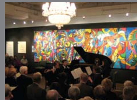
A Chamber Music Program ensemble performs at the National Arts Club.